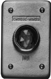
For pilot light units (furnished with jewel and gasket).