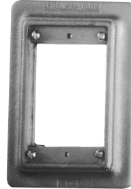
FS Flush mounting adapter (can be used with multi-gang bodies having individual cover openings. Furnished with gasket and screws)