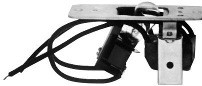
Pilot light (with transformer) †, FD only