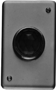
For pilot light units (furnished with jewels)