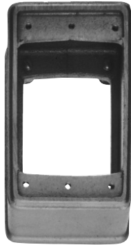
EXF Extensions (takes covers and flush rectangular wiring devices, or plug receptacles with housings)